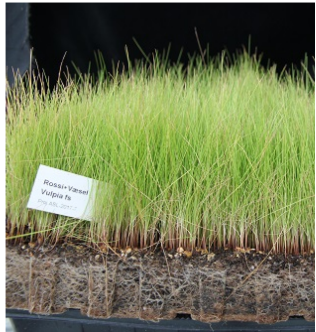
A sown mixture of Squirrel-tail fescue with Strong Creeping Red Fescue